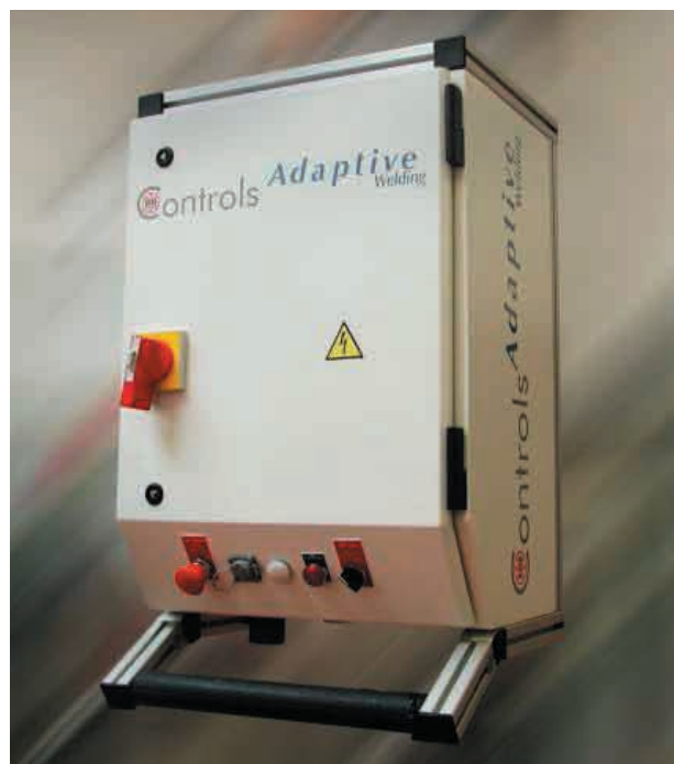
ARO Controls Adaptive Welding

ARO provides world-class after sales service to the many thousands of welding systems supplied over the years, with most providing decades of reliable service. ARO ensures genuine spare parts and expert service are available to all of its markets and supports new equipment commissioning worldwide.