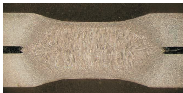
Consistently good weld spots

"System adjusts to the thickness and number of sheets to be welded without the need to change the welding schedule."